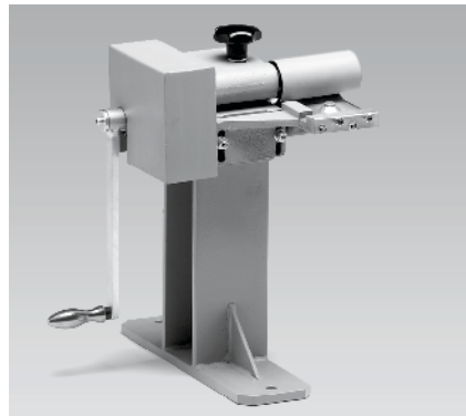
PS-WD-70/V; Manual wedge peeling device